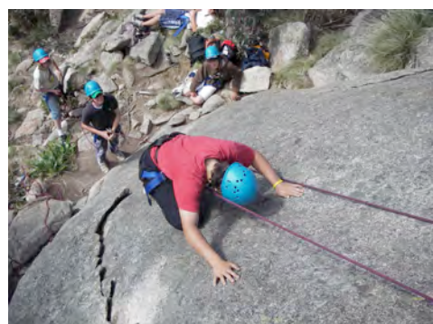
CLIMBING AT CATANI CRAGS